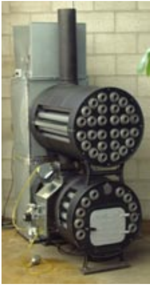
Our Cutaway Floor Model