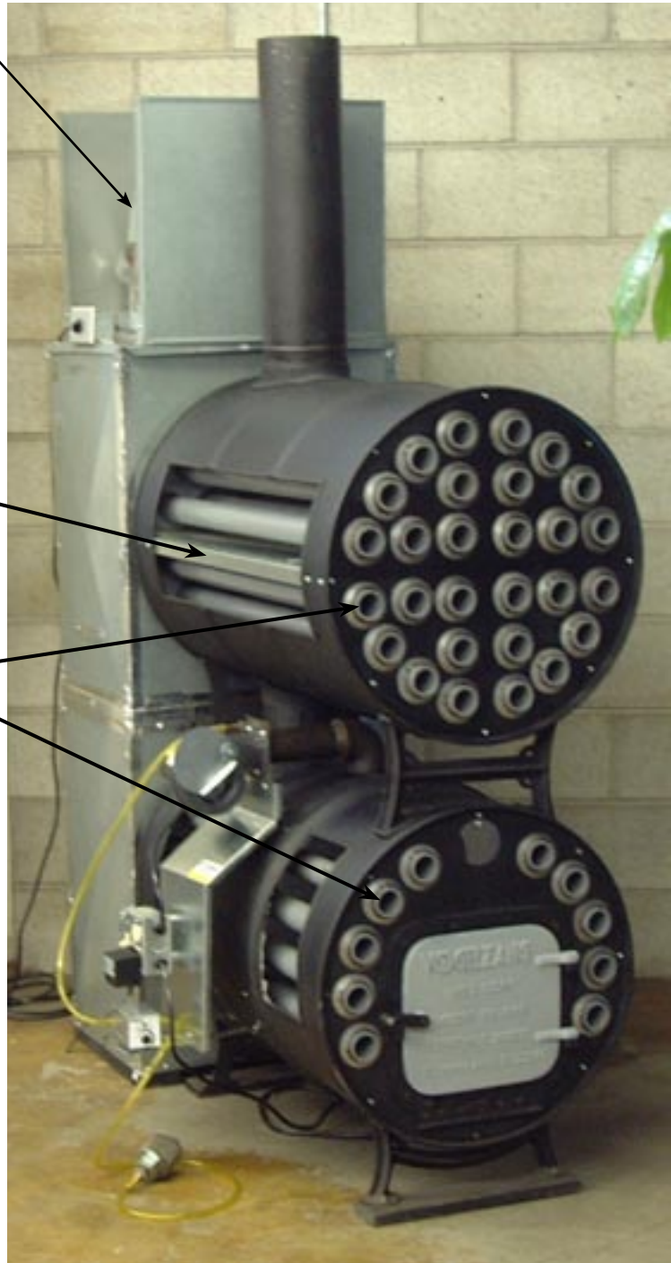
PapaBurn with barrel sides cut away for our display model only

38 steel heat exchanger tubes give 8356 in 2 , or 58 ft 2 of surface area! Compare this with any other used oil heaters on the market!